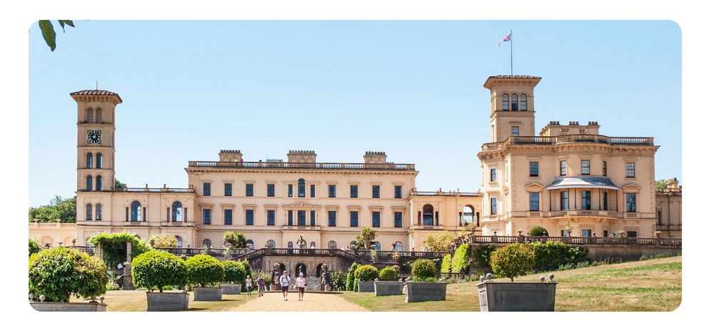
Osborne House is on the Isle of Wight, England.