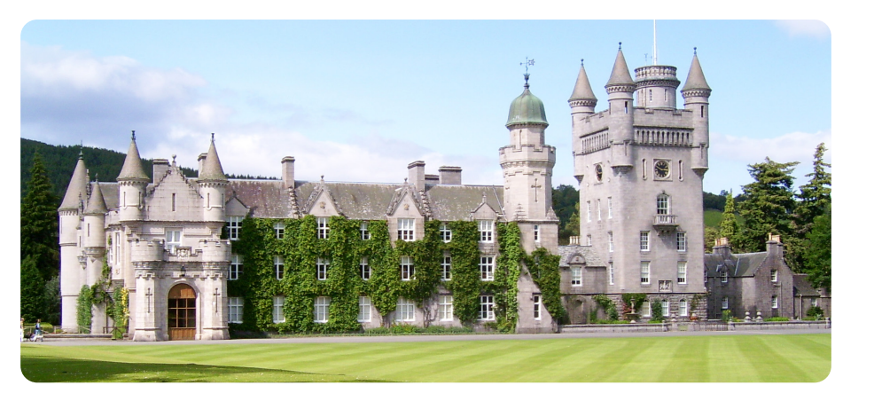
Balmoral Castle is in Aberdeenshire, Scotland.