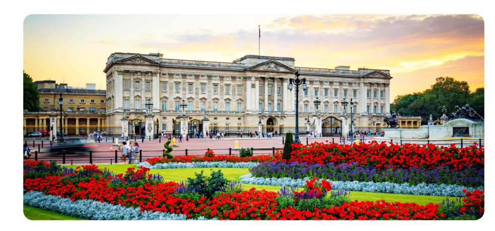
Buckingham Palace is in London, England.

Royal residencies include palaces, castles and stately homes. Some of them are used for official royal business. Some are used as holiday or private homes. Many are tourist attractions.