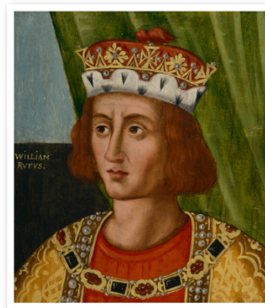
William Rufus (c.1056–1100)

William the Conqueror died on 9th September 1087 while fighting in France. He had decided to make his second son, William Rufus, the next King of England instead of his oldest son, Robert. Robert and his friends were not happy about the situation because they thought Robert should be king. Robert's followers led two rebellions against William Rufus over the next eight years and they were defeated both times. William Rufus died in a hunting accident in 1100 and his younger brother, Henry, became King of England.