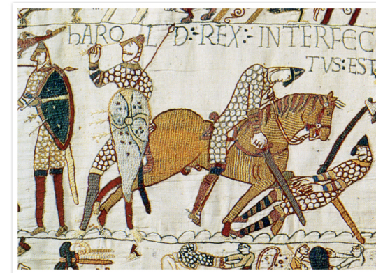
Part of the Bayeux Tapestry showing the death of King Harold II

The Bayeux Tapestry tells the story of the Norman invasion and the Battle of Hastings in 50 different scenes. It is an embroidered cloth over 70m long and 50cm wide. The tapestry shows Duke William of Normandy sailing across the English Channel with his army and horses, the Battle of Hastings and the death of King Harold II. The tapestry is on display in the Bayeux Museum in northern France.